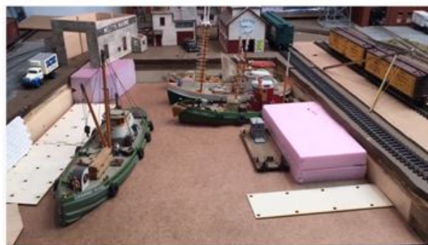
New Haven Railroad Update 40 “Super Elevated Curves & Harbor Info”