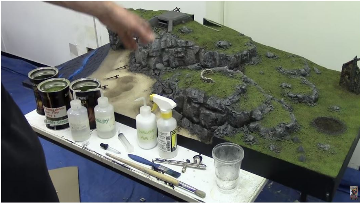
Flock Like a Pro - Insider Tips & Tricks