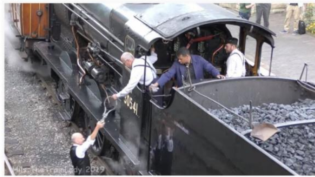
Severn Valley Railway Autumn Gala 2019 - Station Action