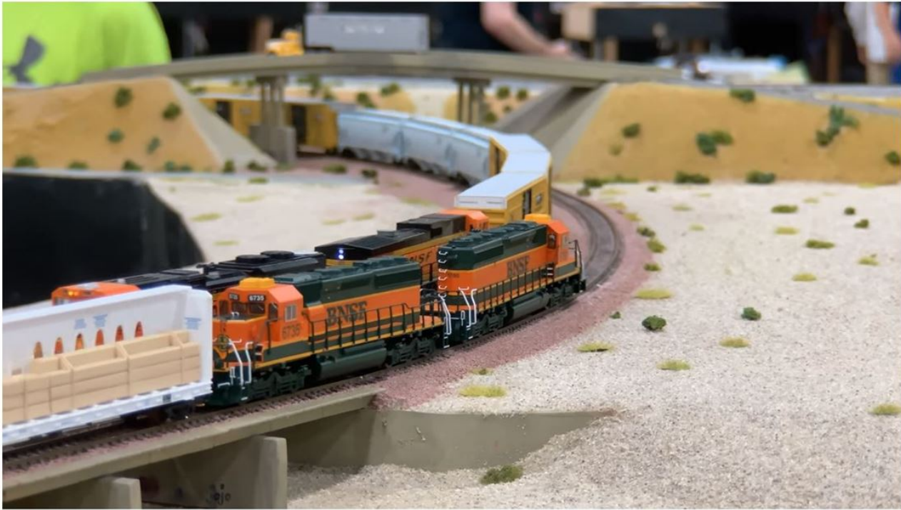
N Scale Free-mo at Salt Lake City 2019