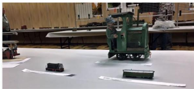
2019 National Narrow Gauge Convention