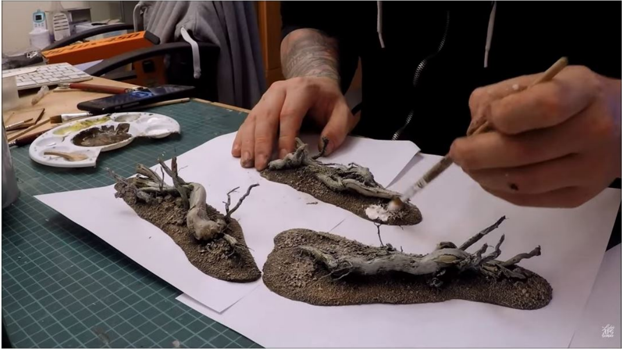
Terrain Using Dead Tree Roots