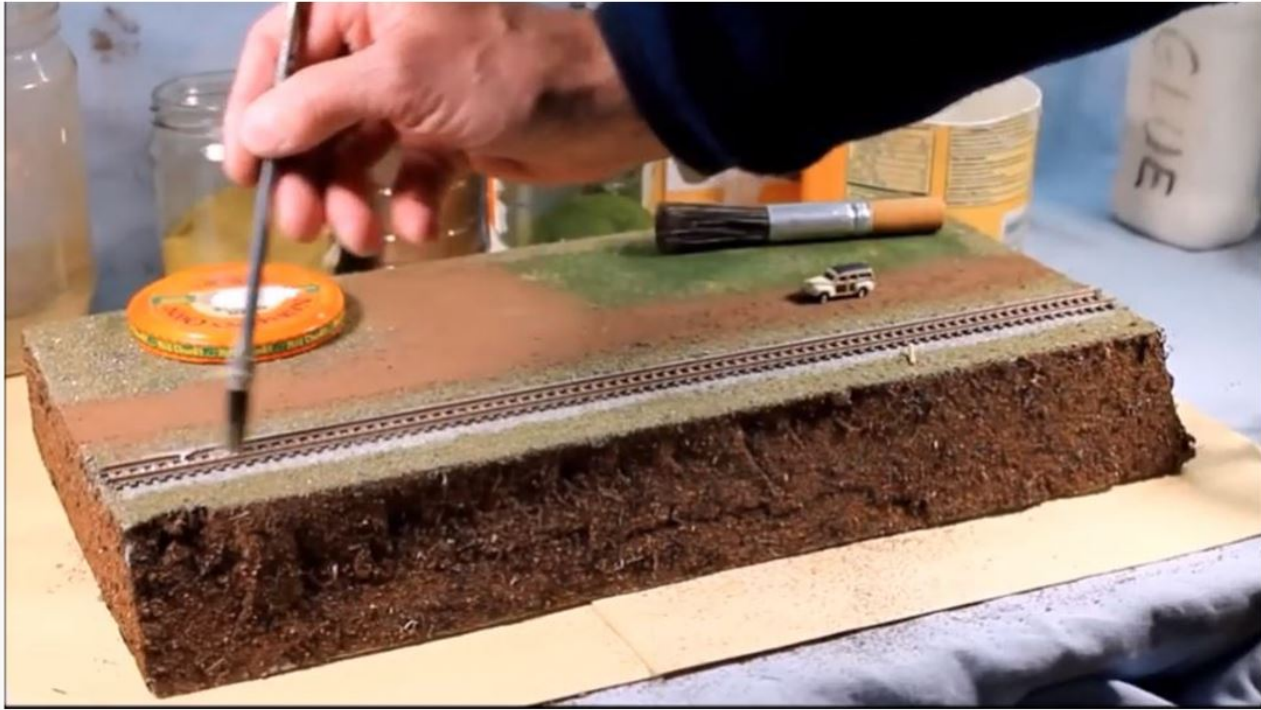
Basic Scenery Techniques