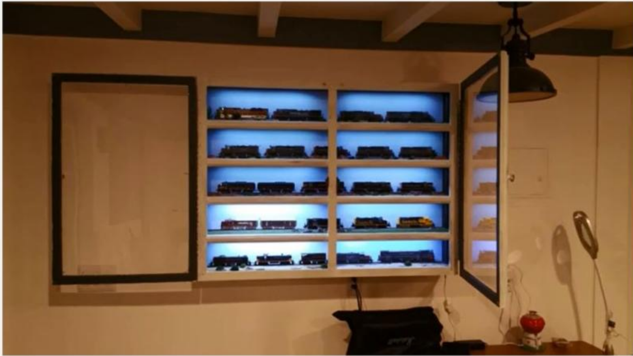
Locomotive Display Cabinet Construction