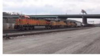
Kansas City Area Rail Action March 2017