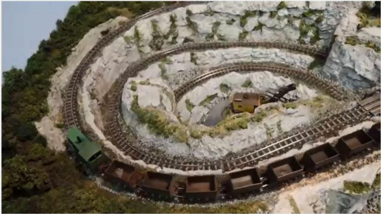
HOn 30 Narrow Gauge Coal Mine Railroad