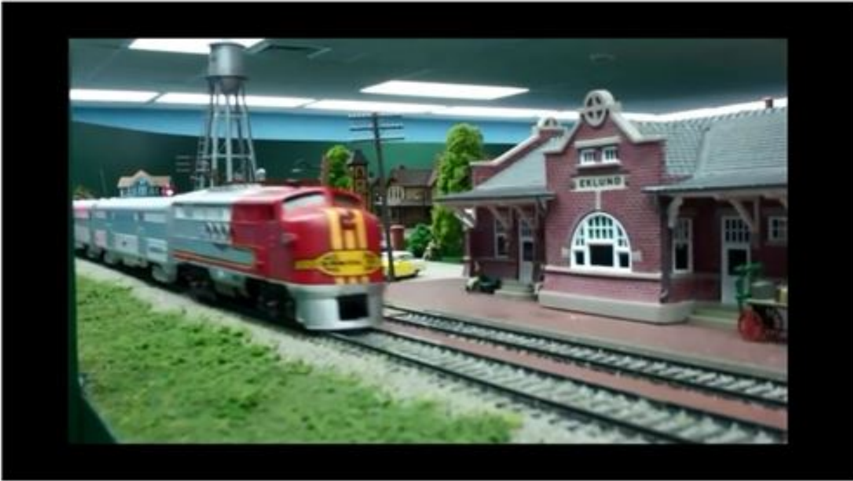
Greater Kansas City Railroad Club & Kansas City Northern Railroad.