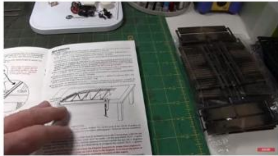
Central Valley Model Works Double Track Truss Bridge Build Part 1