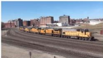
Kansas City Area Rail Action March 2017