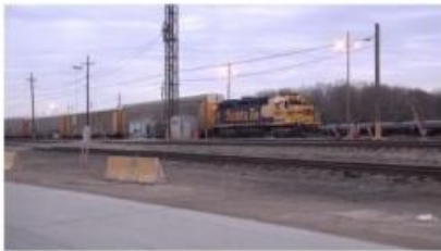
Kansas City Area Rail Action March 2017