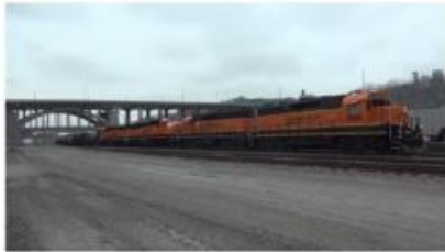
Kansas City Area Rail Action March 2017