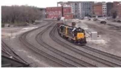
Kansas City Area Rail Action March 2017