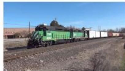
Kansas City Area Rail Action March 2017