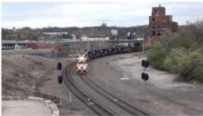
Kansas City Area Rail Action March 2017