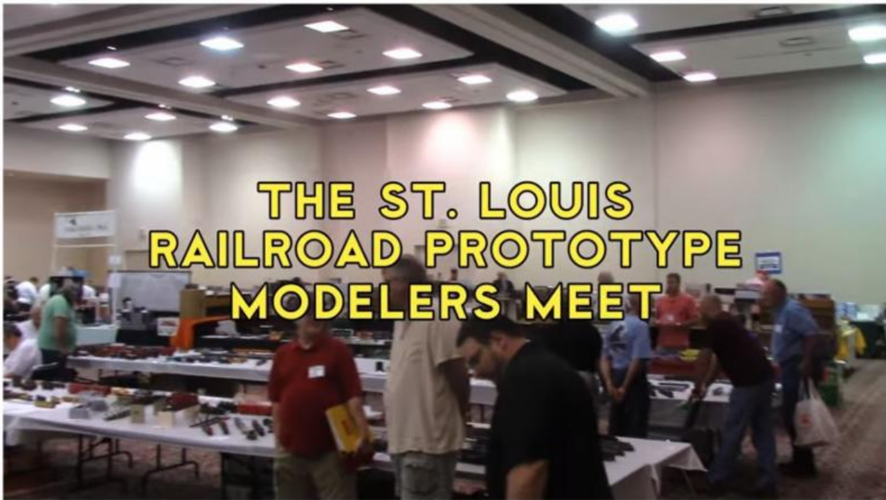
TRAIN SHOW: Railroad Prototype Modelers Meet, Day 1