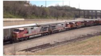
Kansas City Area Rail Action March 2017