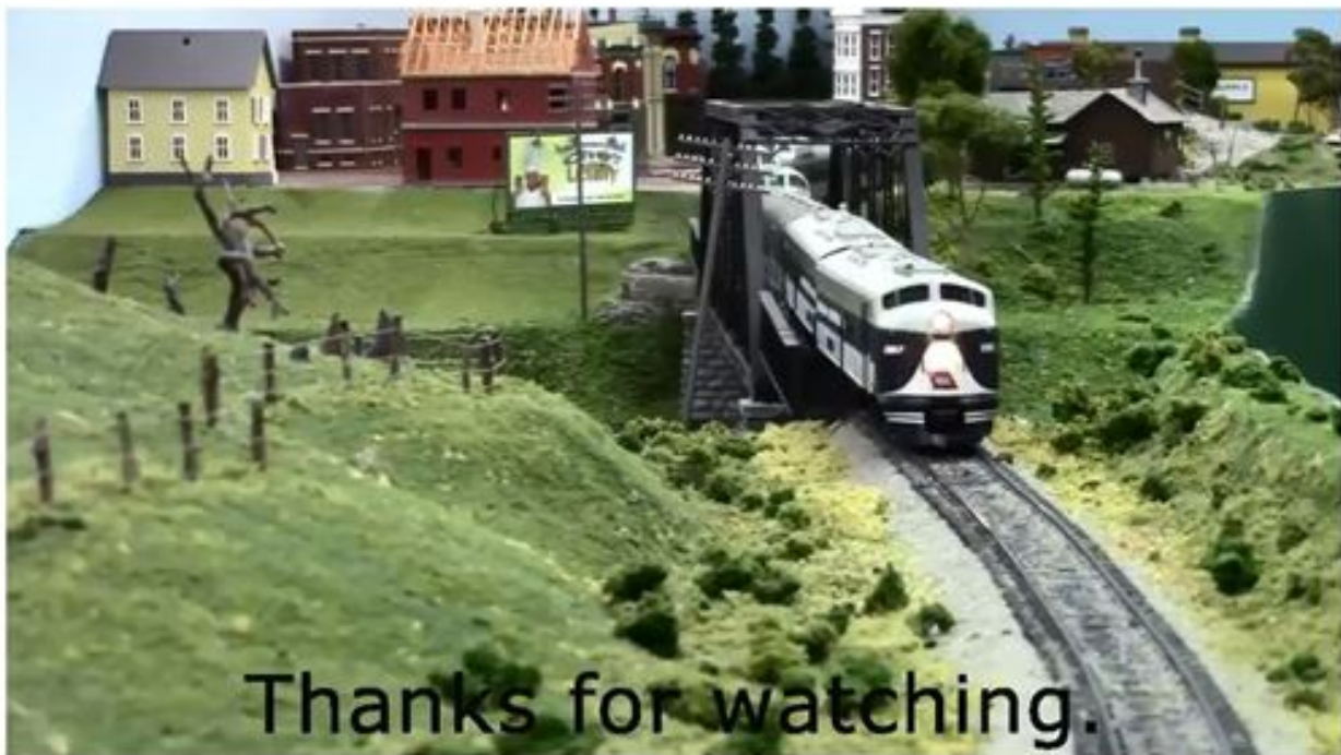
Brush Creek & Western Railroad #3 Blue Bird