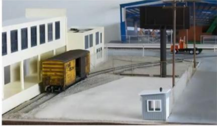
Scratchbuilding a Modern Bakery Complex