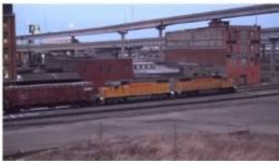
Kansas City Area Rail Action March 2017