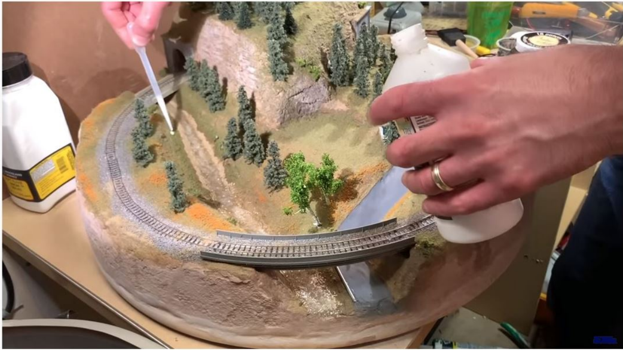
Making a Small N-Scale Micro Layout