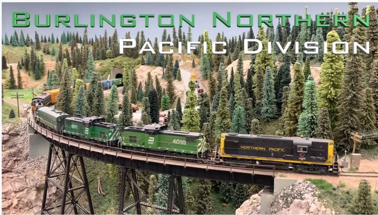
Amazingly Detailed BN Pacific Division Layout