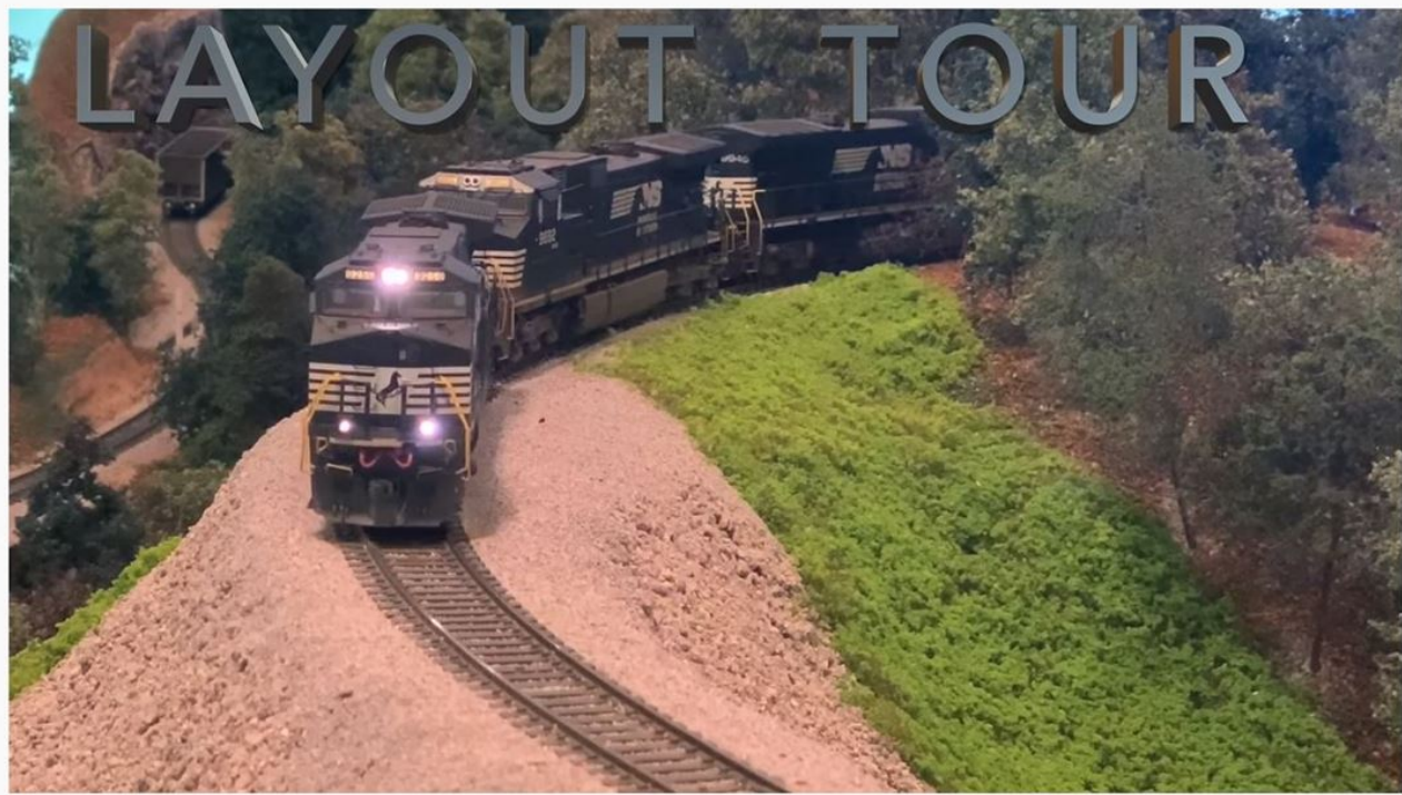
Layout Tour—Modern NS Asheville District