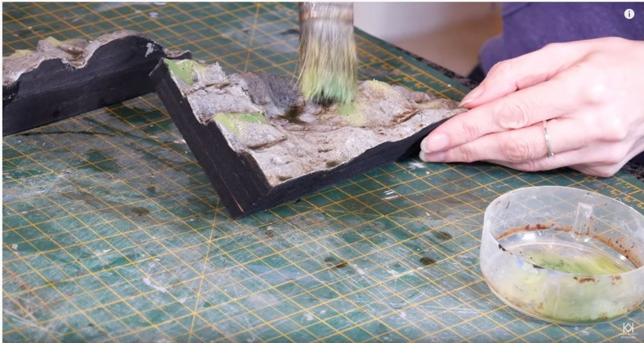
Easy to Make Lightweight Foam Rocks