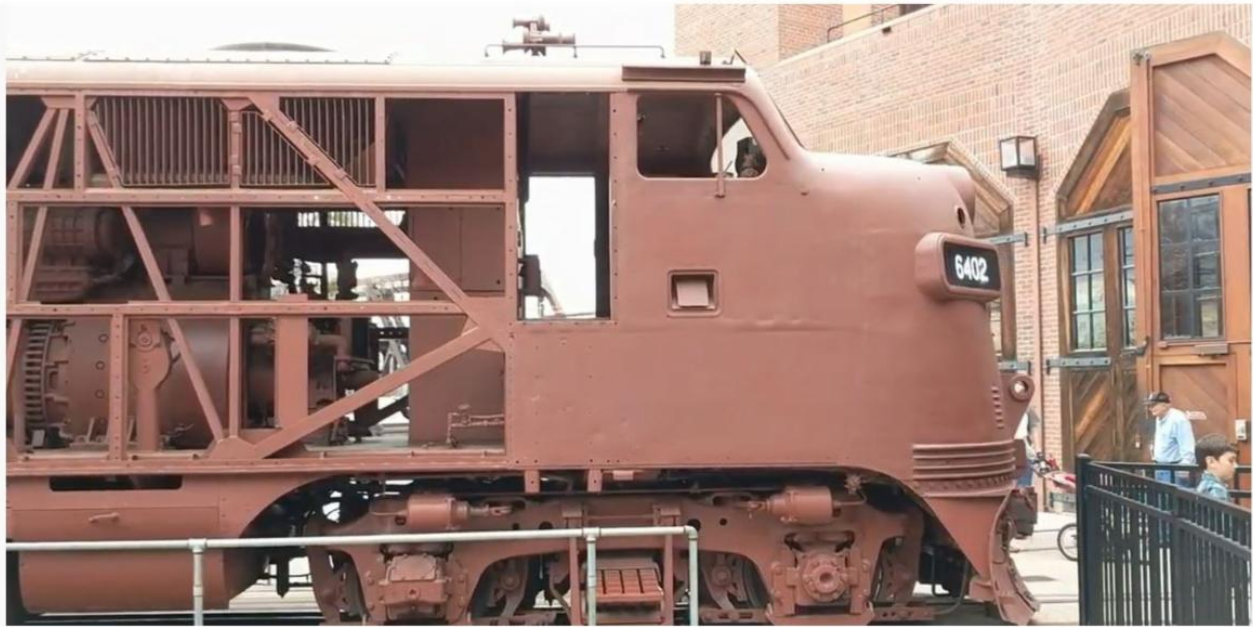
Pulling Out an Old Diesel at CSRM