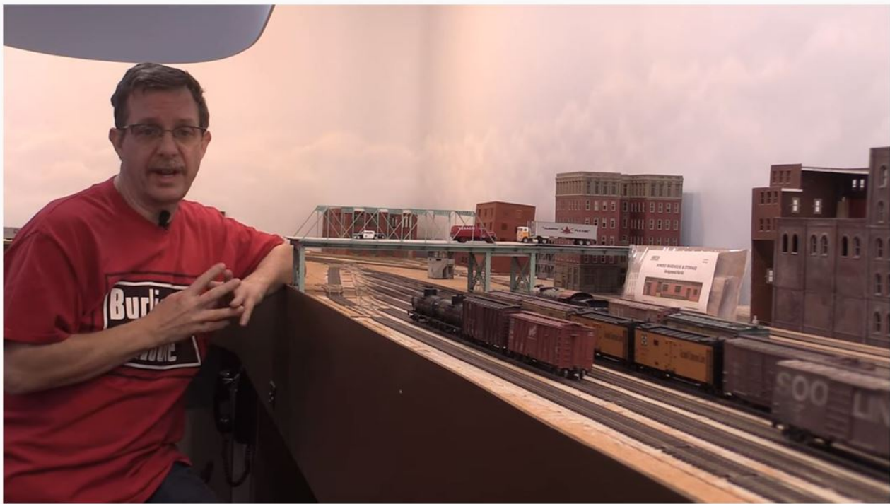
Compressing a Design for a UP Freight House