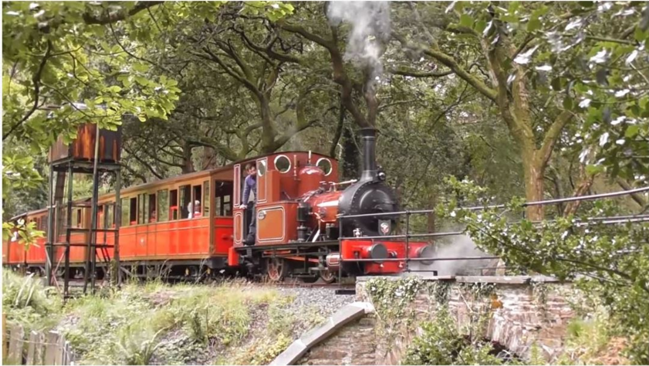
World's Oldest Preserved Railway - The Talyllyn Railway