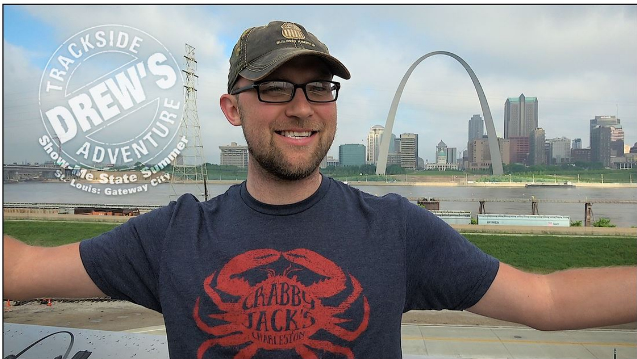
Drew's Trackside Adventures: St. Louis Gateway City, Episode 42

A Members-Only Exclusive Clinic from Model Railroader Video Plus