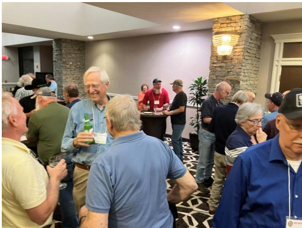
Thursday night reception