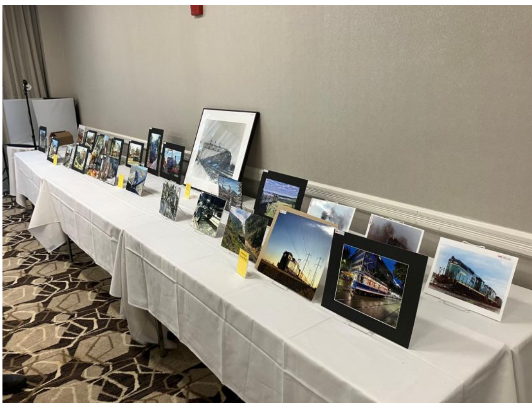
Photo contest for the convention