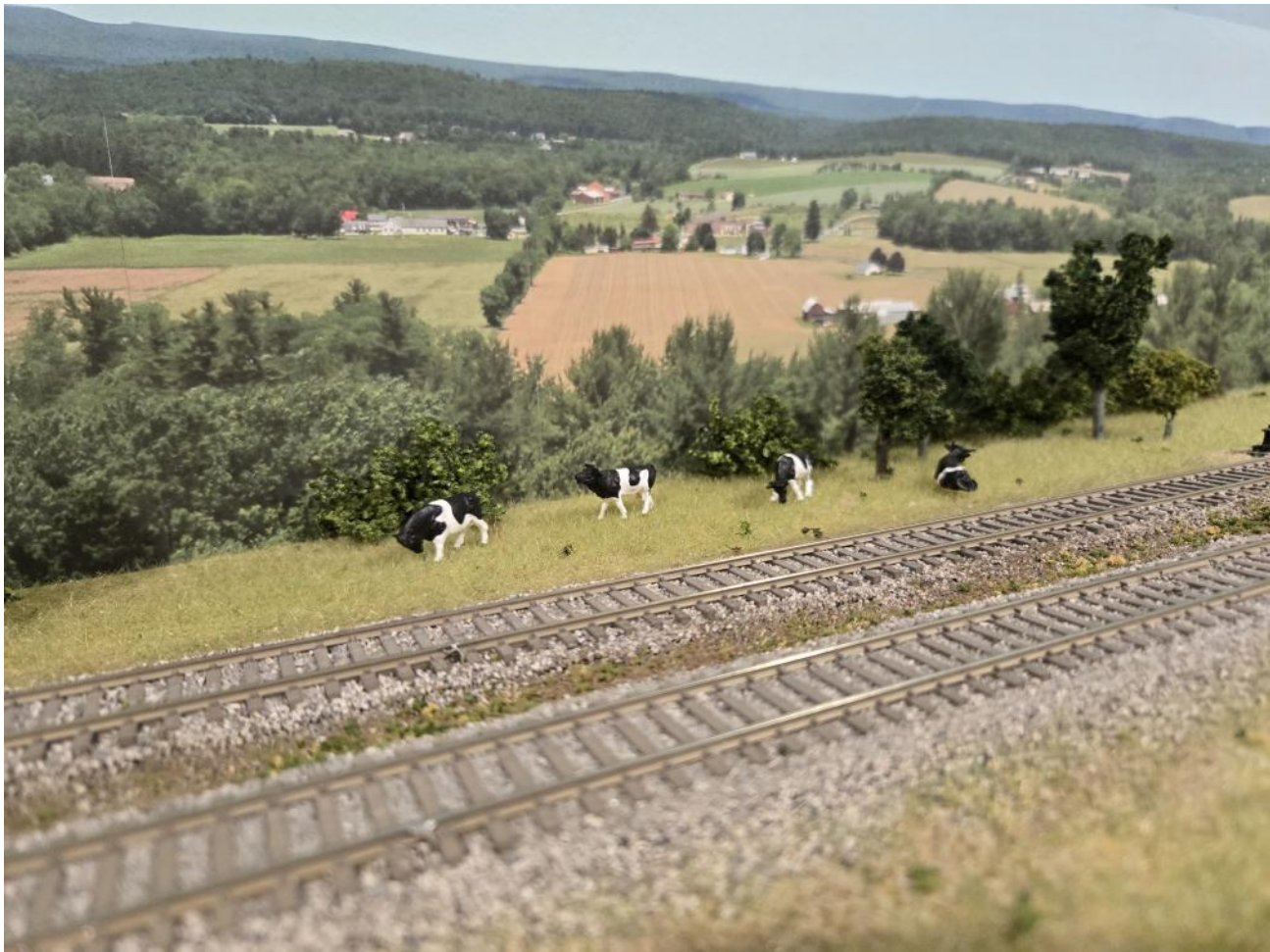
Photo below is on Peters layout, nice job blending foreground into background phot Geoff Anthony