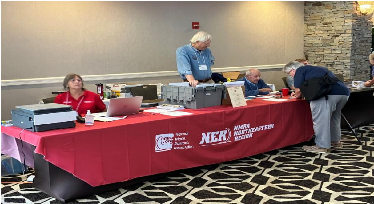
Front desk For the Convention