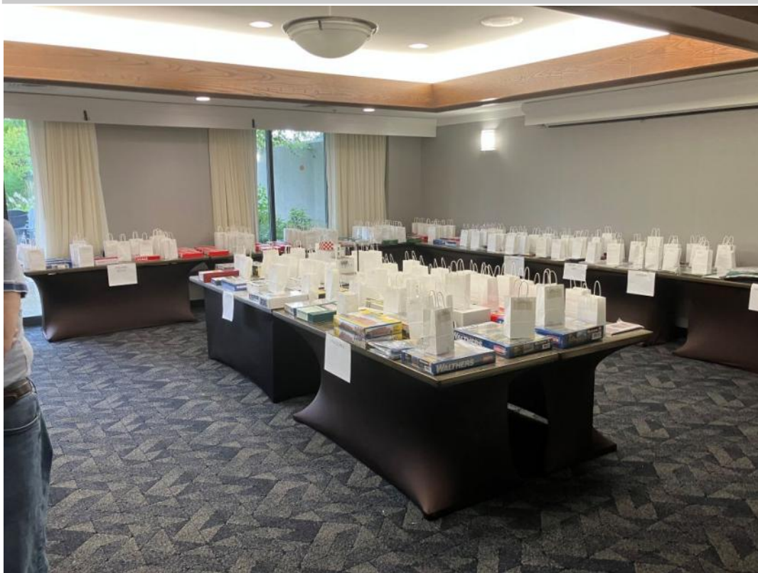
Raffle Room for the convention , lots of good stuff