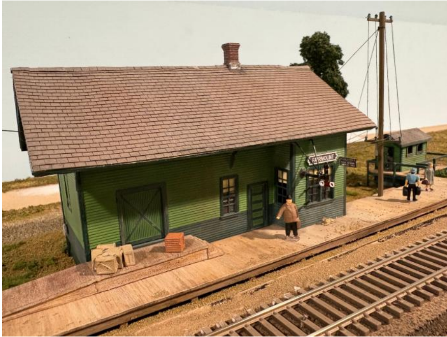
Photo to left is the Fairmount Combination station scratch built by Chip Faulter for Peter