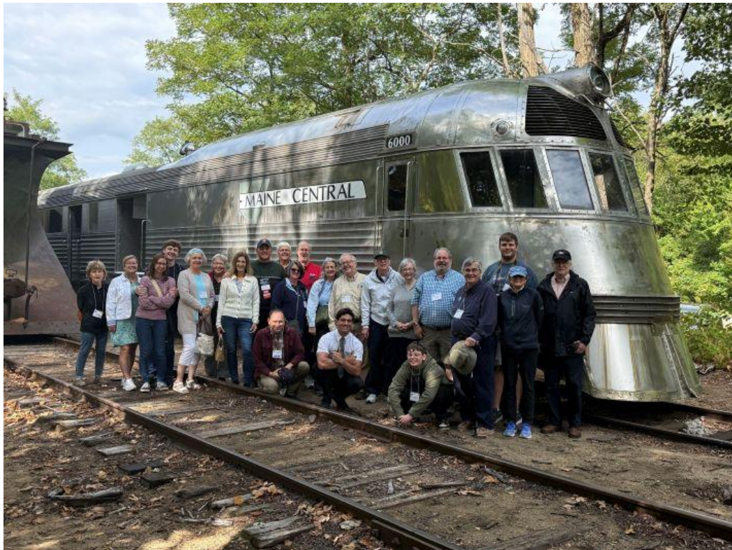
One of the prototype tours enjoying the good weather and tour