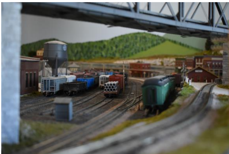
Fig 1 top left , fig 2 top right and fig bottom left