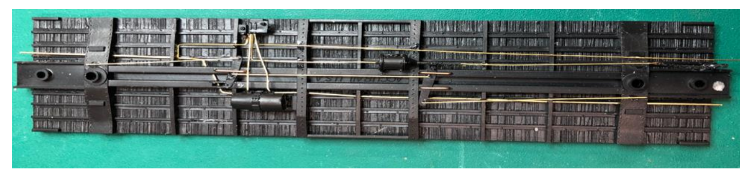
Fig. 4 Completed undercarriage AB brake parts with air lines.

I used .019 brass wire for the primary airline and .012 brass wire for all other lines/rods. It would be nearly impossible for me to properly bend the main line to fit appropriately without kinking the line. I cut three separate parts: two longer pieces with a bend into the center beams and a short piece between the center beams connecting the other two pipes. If the break is inside the drilled holes it looks like one continuous pipe. I used .012 wire to connect the AB control valve to the air reservoir and brake cylinder making sure to match the Data Sheet. I added the two Cal Scale brake levers and scratch built the support brackets (.012 wire). Rods were added to connect both brake levers and from the levers to the bolster where the pinch arm would be located. Since I did not add a pinch arms (they would be hidden by the trucks) I glued them to the bolsters. At this point frequently check to make sure there is no interference with the trucks by placing a truck on the bolster and swivel side to side. For the handbrake rod I slightly bent a piece of .012 wire at each end and glued 40 links to the inch brass chain with CA to both ends, cut to the appropriate length. The last piece of piping was the retainer valve line from the AB control valve to the B end of the car. Once complete I sprayed the bottom black