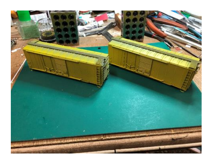
Fig 10. I sprayed the lighter color first.

This was the first time I detailed rolling stock and am pleased with the outcome. These two additions will look good serving the lumber industry.