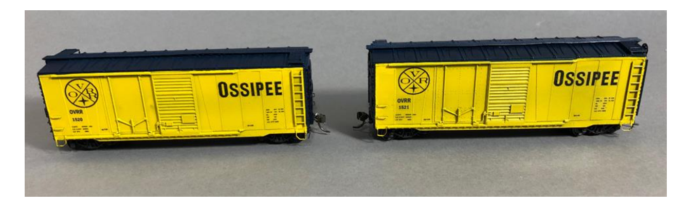
Fig. 12 Completed model with decals and weathering added.