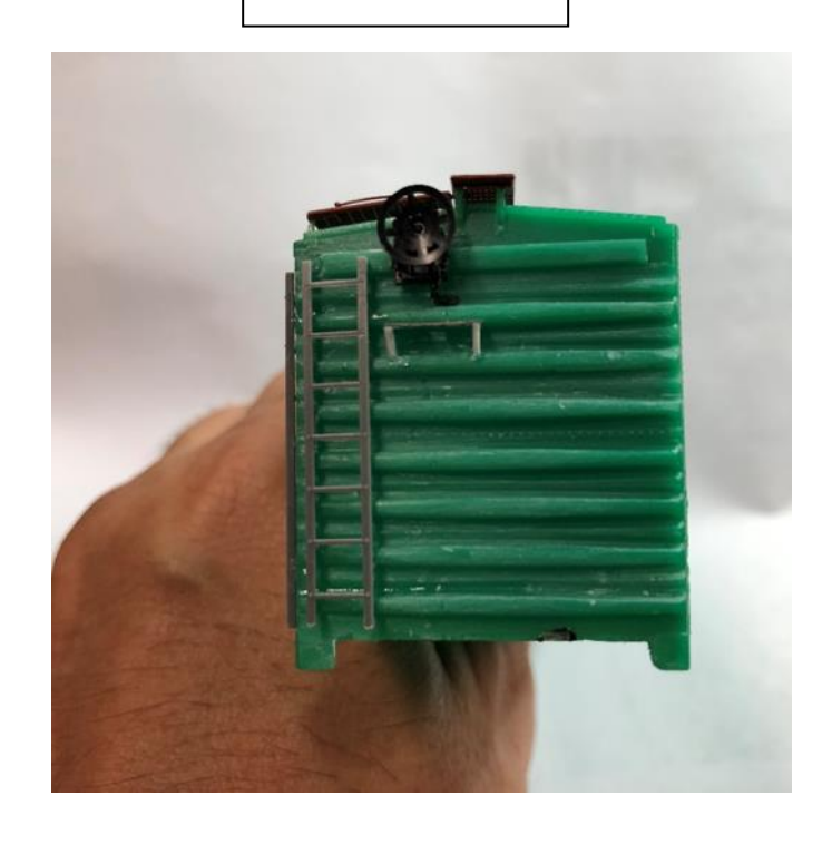
Fig. 8 B end with added ladder, brake housing and platform.

For the ends I added tack boards to each end and on the B end (brake end) I added a Plano brake platform supported with styrene strips. I replaced the supplied brake wheel with a Cal Scale Ajax hand brake attached to scratch built styrene brake housing. The remainder of the end detail was added after I secured the undercarriage to the body.