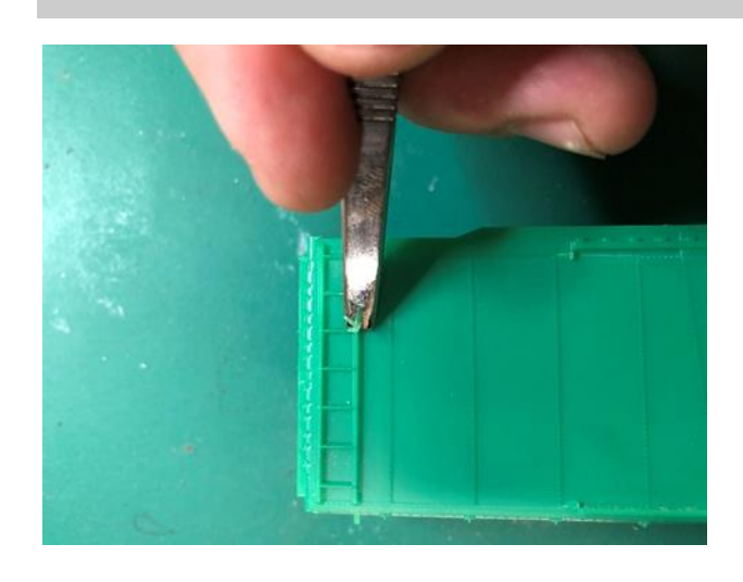
Fig. 1 Using a chisel to remove the plastic molded ladder