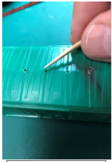
Fig. 3 Drill new holes for the Kadee running board and fill in the unused holes.

For the roof I removed the Accurail running boards and molded on supports, filling in the holes with putty. I had to drill new holes and apply new supports from styrene to mount the Kadee Apex running boards.