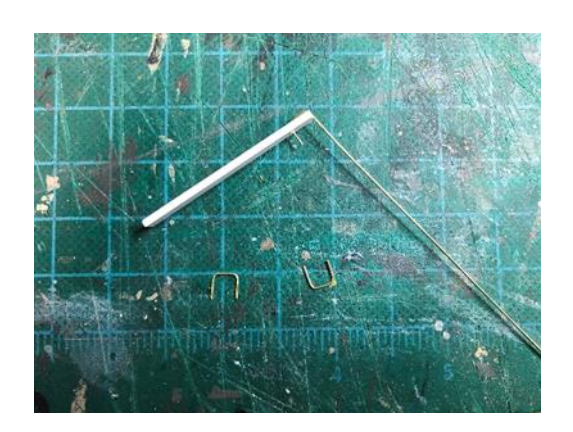
Fig 5. Grab iron jig.