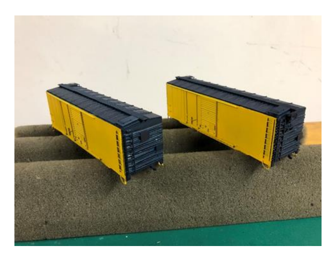
Fig. 11 I masked the sides and sprayed the darker color.