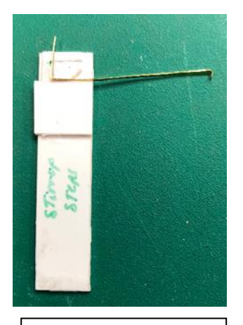
Fig.6 Stirrup jig.