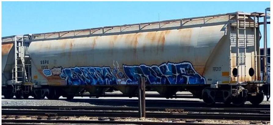
Top photo at Waterville yard summer of 2018

I hope that all of you have remained safe and I will see you at future shows