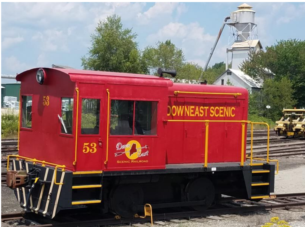
Downeast Scenic loco #53 a Plymouth critter . Washington Junction June of 2016 . Photo by the editor