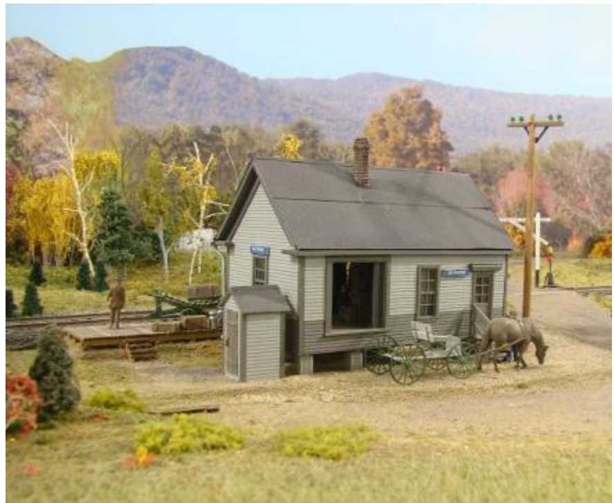
Heritage Park Railroad Museum photo of Mathews station, North Wakefield, 1909.

Photo by Rich Breton. Submission by Bill Graver