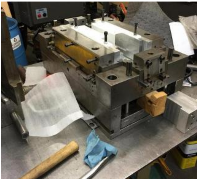
Mold for HO scale RS-3

Many of you likely have a locomotive on your layout