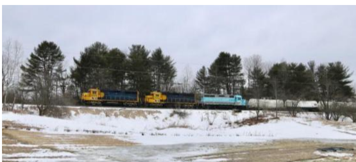
CMQ on the way to Searsport.

No new members reported this time . Do you have a friend that would benefit from being a member? Even one new member can make a difference .