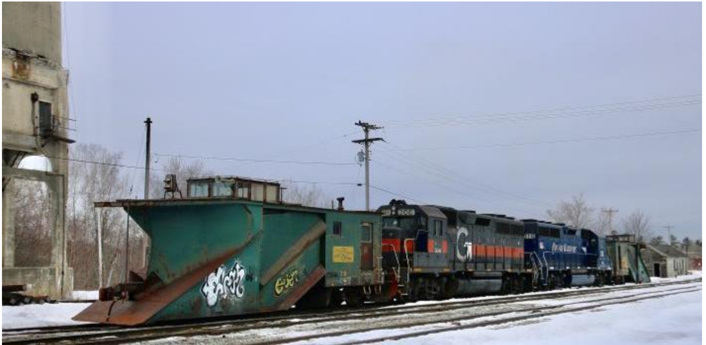
Images that we hope not to see until next year. Northern Maine Junction on 2/7/18 awaiting the storm and CMQ train on the way to Searsport around Prospect and Lanes pit the same day.