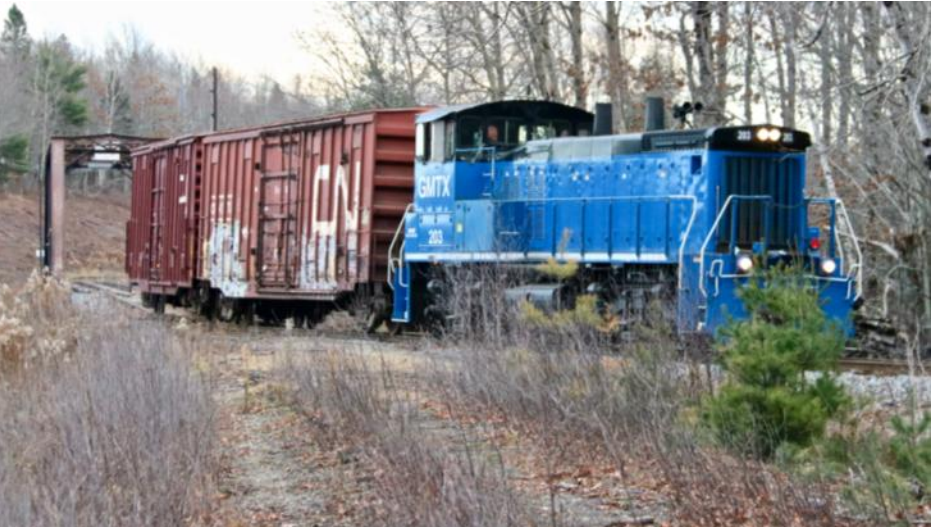
Baileyville Mill switcher at the border and by the wye on the old Maine central. On pg 2 in the Moosehorn wildlife refuge on the way to the mill.