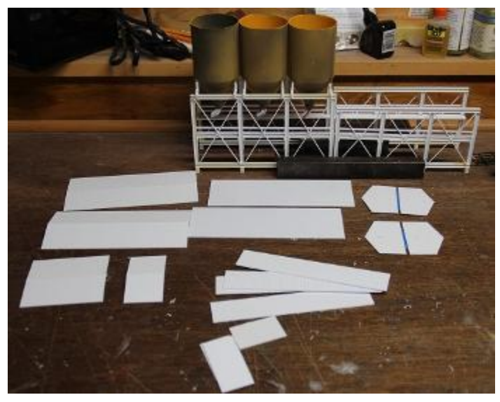
Using two different sizes of Evergreen Metal Sidings I cut and fitted the penthouse sides and roof using .060" plan styrene for floors.