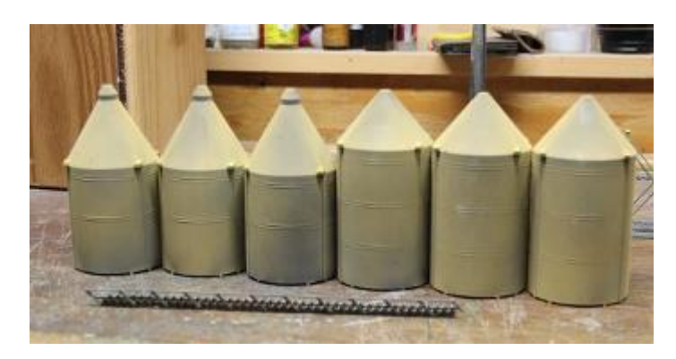
I salvaged six silos or bins and a stairway from parts of an old, AHM I believe, gravel plant building purchased at a train show.

Since I have filled all but one space on my layout for anymore major structures and I enjoy building structures, I am down to redoing some of my earlier efforts or removing and replacing structures. My first loader for my talc plant lacked some of the logical loading detail because it was on bench work low enough so you looked primarily at detail on the top on the previous level. Now it was on the upper level of the new layout and the top detail was not visible and the missing detail was obvious.