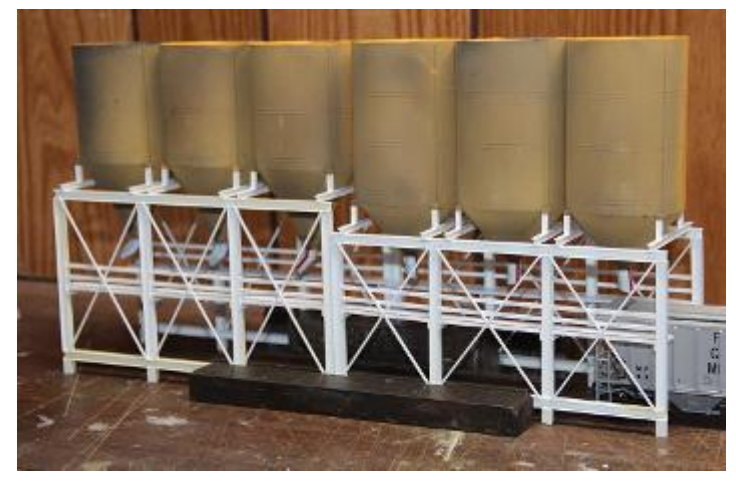
Using some of the inventory of Evergreen structural shapes that I have accumulated over the years to fabricate two similar bases for the silos that are two different shapes. Having the separate bases implies that there is "add-on" architecture involved here.