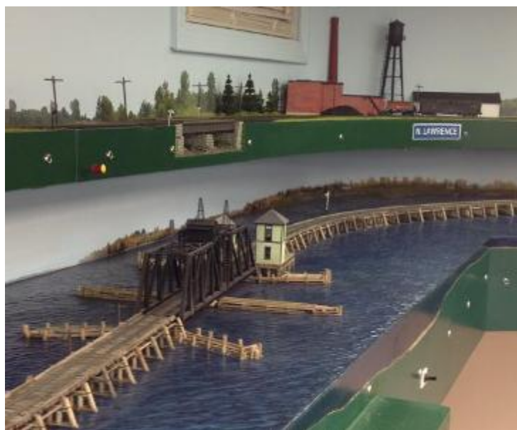
"Seacoast Division NMRA members Tom Oxnard, Peter McKenney, Chip Faulter along with several other Pacemaker convention attendees operated on Andy Clermont's beautiful Ogdensburg & Lake Champlain (O&LC) Subdivision HO scale layout. The O&LC Subdivision is a prototypical depiction of the Rutland Railroad in upstate New York with interchanges with the CV, CN, D&H, NYC, and Norwood and St. Lawrence Railroads. Shown in the photo is one of the signature scenes on the layout, this one showing the Rutland gauntlet-tracked trestle/bridge connecting NY and VT across Lake Champlain. The prototype trestle was nearly a mile long ... Andy's rendition is nearly 10 ft and beautifully done!"

found the hotel staff friendly and knowledgeable about hosting the convention. The hotel itself was an older hotel that had been updated and converted into a convention center. It was actually ideal for the NER convention and had space for all of the planned on-site convention functions. The room rate was $126 plus taxes a night single occupancy. So, if you and a buddy wanted to share a room for the convention, you could do it for about $70 a night. I think that is a pretty reasonable rate! The rooms were fine, the water warm, the fitness center adequate and the beer in the tavern was cold.