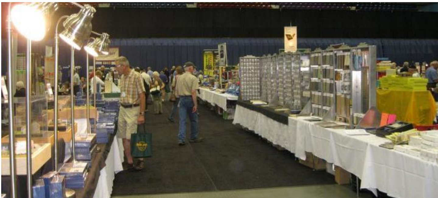
National Narrow Gauge Show floor of civic center

Division NMRA was tied with the Little Rhody Division NMRA for the greatest number of AP certificates (15) achieved by its members over the past two years.