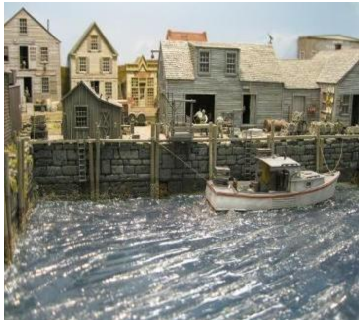
Just one of many great modules at the National Narrow Gauge Convention in Augusta .

NEXT MEETING: Saturday January 7, 2017 10-2 : The First Congregational Church of Christ , 301 Cottage Rd , South Portland ME