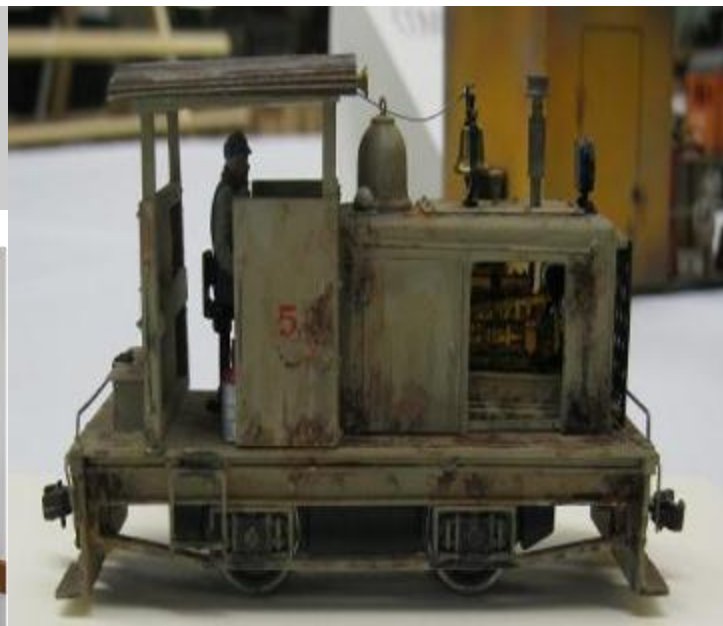
Photo on bottom left is from one of many outstanding modules. top right photo is from the contest from the National Narrow Gauge Convention