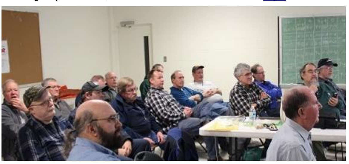
30 NMRA members and guests attended the Spring Event of the Seacoast Division NMRA at the Rochester, NH Community Center.

The second portion of the event was an open house at the Heritage Park Railroad Museum in Union, NH. See their website at <a href="http://">http://</a>