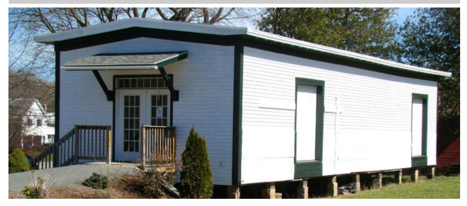
Built in 1875, the freight house at the Heritage Park Railroad Museum in Union, NH served the B&M railroad there for many years. Today this restored structure is home to a beautiful model railroad accurately depicting the local area.