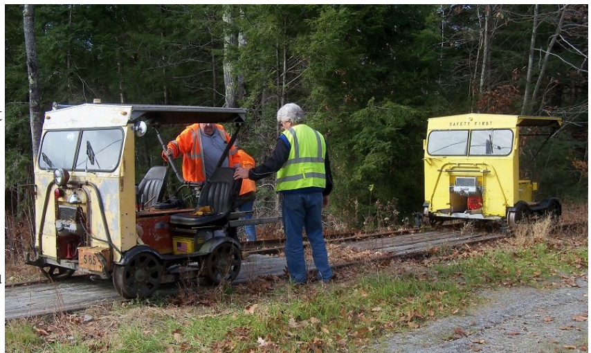
See New Hampshire's spectacular fall foliage in this very unique way aboard a Speeder!

After the fun and all the great activities at the NER Convention how about taking a motor car (aka "Speeder") trip through New Hampshire wood lands. The trip covers eight miles of track owned by the State of New Hampshire through forest and waterways used by beaver and other native animals and during the fall convention dates the autumn foliage colors will be at their peak.