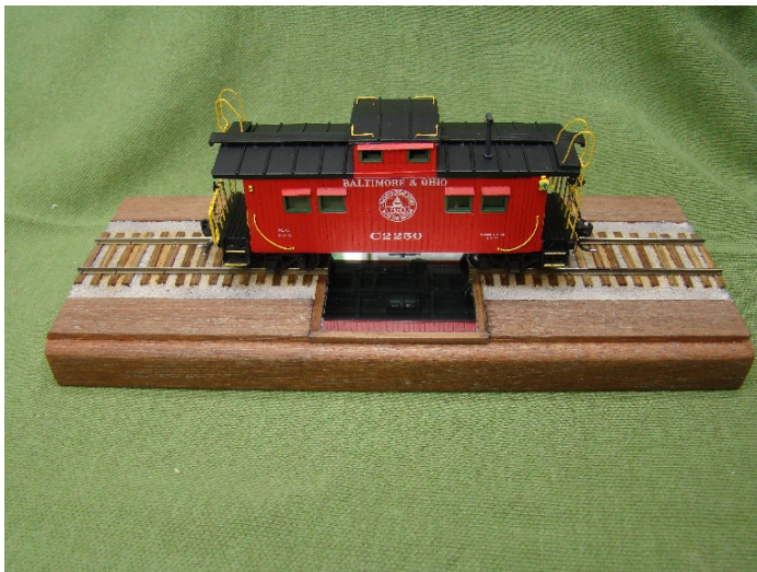
Contest model of Baltimore & Ohio caboose class I-5C which received second highest point total at 2012 NER convention in Syracuse, NY. Contest display included a mahogany wood display base with inlaid mirror to show scratch-built brake detailing.

The last issue featured Rich Breton's award for his B&O caboose. Here are more photos by Rich of that model.