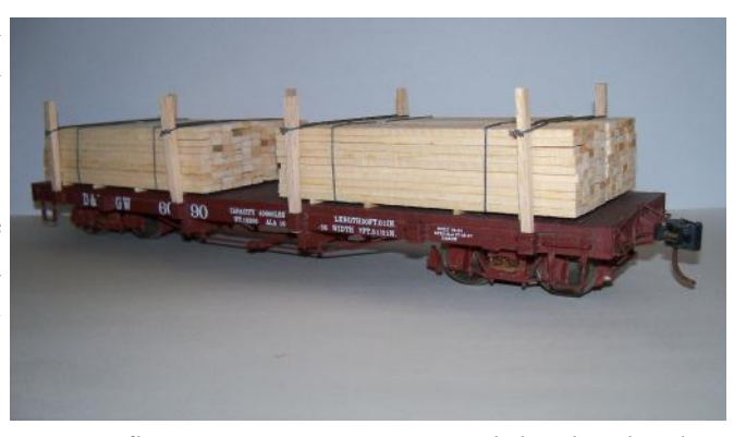
Fn3 flat car D&RGW 6090 with lumber load

But I always pursued my own interests in creating the Valley Junction Railroad that resides in the basement in HO scale.