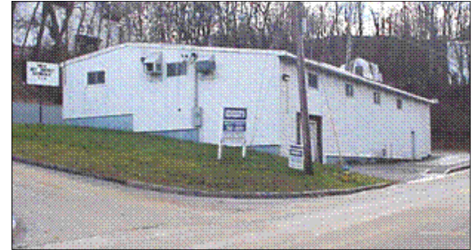
The Great Falls Model Railroad Club, 144 Mill St Auburn, Me 04210

Because the club has been recognized as a 501(c)3 Educational Foundation since 1993, donations to the club are tax deductible. As part of our mission as an educational foundation, club members have helped