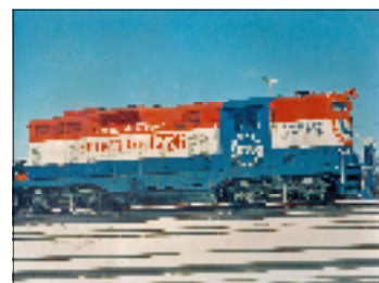
BAR Spirit of 1776 in 1976