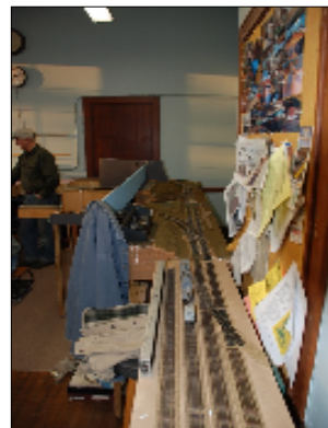
Another picture of the Concord Model Railroad Club.