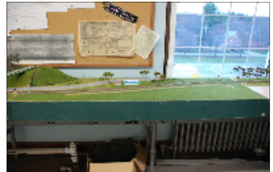
Boscawen area of the Concord layout.

The club meets weekly on Thursday nights at 7PM. The first week of each month is a business meeting-work session, the second Thursday is an operating