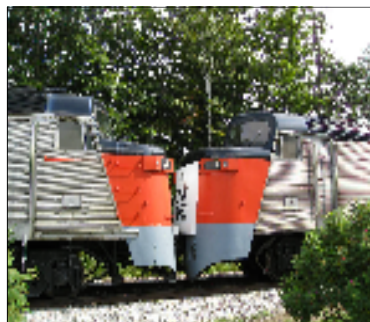
Roger Williams locos in Lincoln NH.