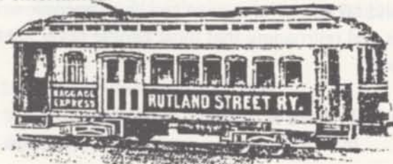
NER Coupler #171, p. 10