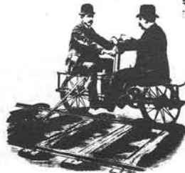
Are we coming or going?

You say that you can't be a good member of an organization which is "ignoring a person who was one of the beginners back in 1927." I really don't follow you. Last year you and I had a nice conversation and you invited me up to Mayfield "next time I was in the neighborhood." I have not yet fulfilled that invitation because of not being in your area recently. But who is ignoring whom? You seemed to be in a conversation with many of the members at that convention. I did not observe any ignoring, and I fail